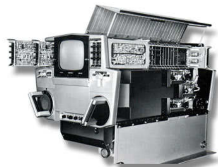
TK 42 with covers open

(1) 79 cores + 6 co-axes. With Cannon Plug??.