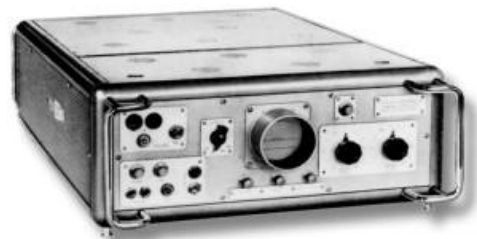
Peto-Scott CCU & waveform mon.

This seems to be a nicely thought out small broadcast camera with a lot of the features of it's bigger brothers, Talkback, cues, good focus control.