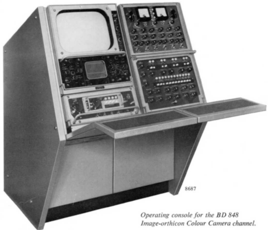
Operating console for the BD 848 Image-orthicon Colour Camera channel.

The remote control panel is mounted beneath the picture and waveform monitor and includes the iris control transmitter, the