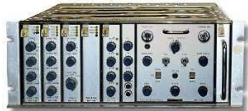
Telecine CCU B3126

Solid State, apart from the EHT rectifiers and stabilizers, with tilting viewfinder and side carrying handles. Plug in modules in camera and CCU. The construction style matches the MkV Image Orthicon camera and the MkVII colour camera, but it is tiny by comparison. A small basic version of the camera head was available for use as a telecine or caption camera. Combined CCU & PSU 7U high rack mount.