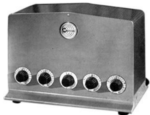
Control & power supply unit