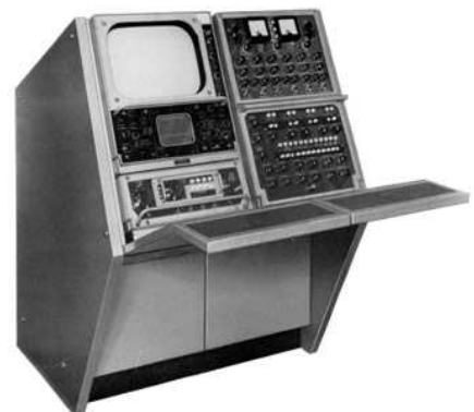
Control unit for B3200 camera

Marconi Sound & Vision Broadcasting 1966. Marconi catalogue 1964.